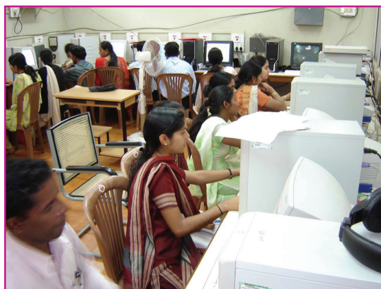
A training programme in progress

This Course is designed for those who have passed X standard or equivalent examination and would like to continue their education towards a Senior Secondary Certification, equivalent to XII standard. The course is recognized by many boards of school education and by several universities for admission to higher education. The list of Boards and Universities recognizing NIOS certificates is available at Annexure 'G'. Details of above two courses are available in the Prospectus for Academic Courses.