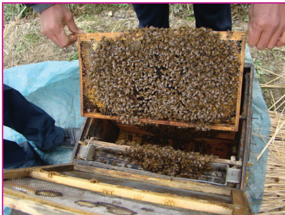
Vocational Certificate Course in Bee Keeping.

NIOS also offers vocational education courses at school level keeping in view the needs of target groups. Presently 88 courses are on offer in the broad areas of Engineering & Technology, Health & Paramedical, Home Science & Hospitality Management, Computer & Information Technology, Business & Commerce, Agriculture and Teacher Training etc.