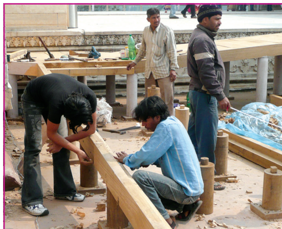
NIOS students in one of Vocational (Carpentry) Training Programme.